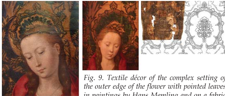
Fig. 9. Textile décor of the complex setting of the outer edge of the flower with pointed leaves in paintings by Hans Memling and on a fabric from Belorechenskaia.

Mangup, where the cut of the cloth and décor of the fabric are similar to the those found in kurgan 20 (Fig. 10).