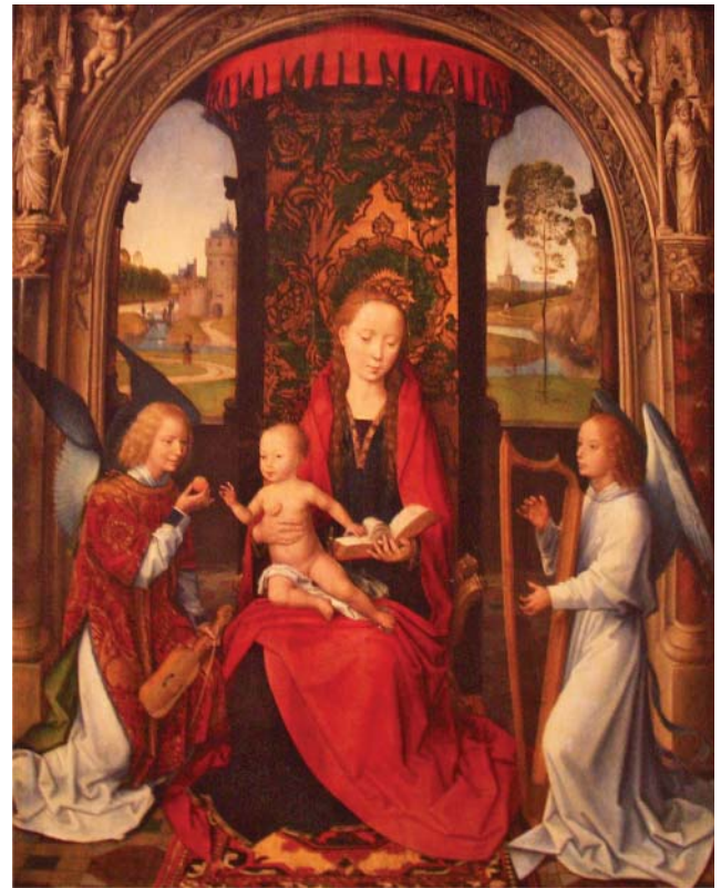
Fig. 8 (right). Hans Memling. "Madonna and Child with Angels." National Gallery of Art, Washington, DC. Andrew W. Mellon Collection (1937.1.41).