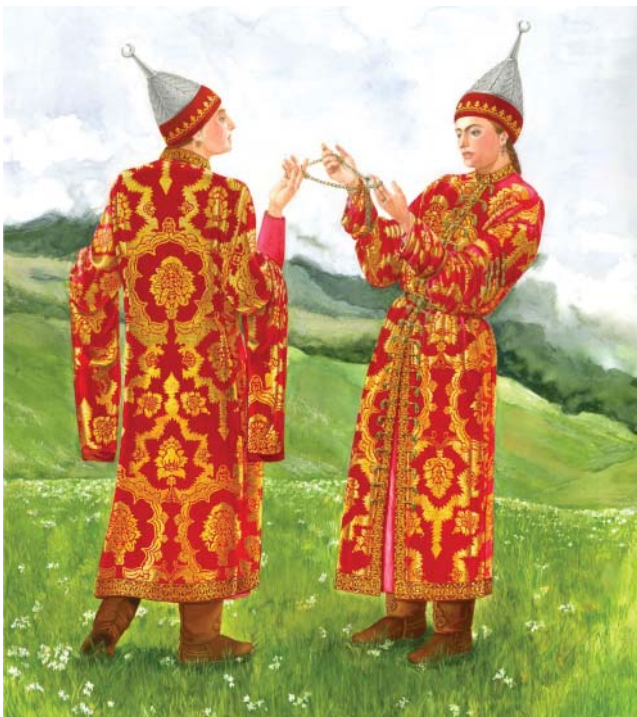
Fig. 2. A female costume from Belorechenskaia Kurgan 20. Reconstruction by Zvezdana V. Dode, drawing by Irina P. Oleinik.

It would be hasty to reject the notion of a weaving industry in the Crimea that could satisfy the needs of the ordinary population and produce simple silk fabrics for export. However, there are no grounds to discuss the presence of highly specialized local weavers there. And thus, more specifically, there is no basis to place workshops in the Crimea, namely in Kaffa, that could have woven the complex silk fabrics found in the Belorechenskaia kurgans.