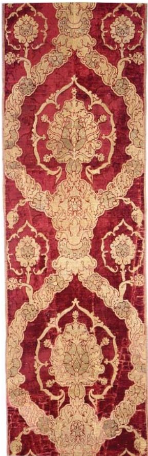
Fig. 4. Venetian velvet of the late 15 th century. The Metropolitan Museum of Art, New York. Rogers Fund, 1912 (12.49.8). Reproduced with the kind permission of the museum.