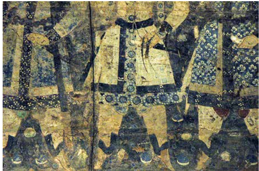
Fig. 10. Detail from mural depicting one of the last episodes of the Rustam cycle, Panjikent, Room 41/VI.