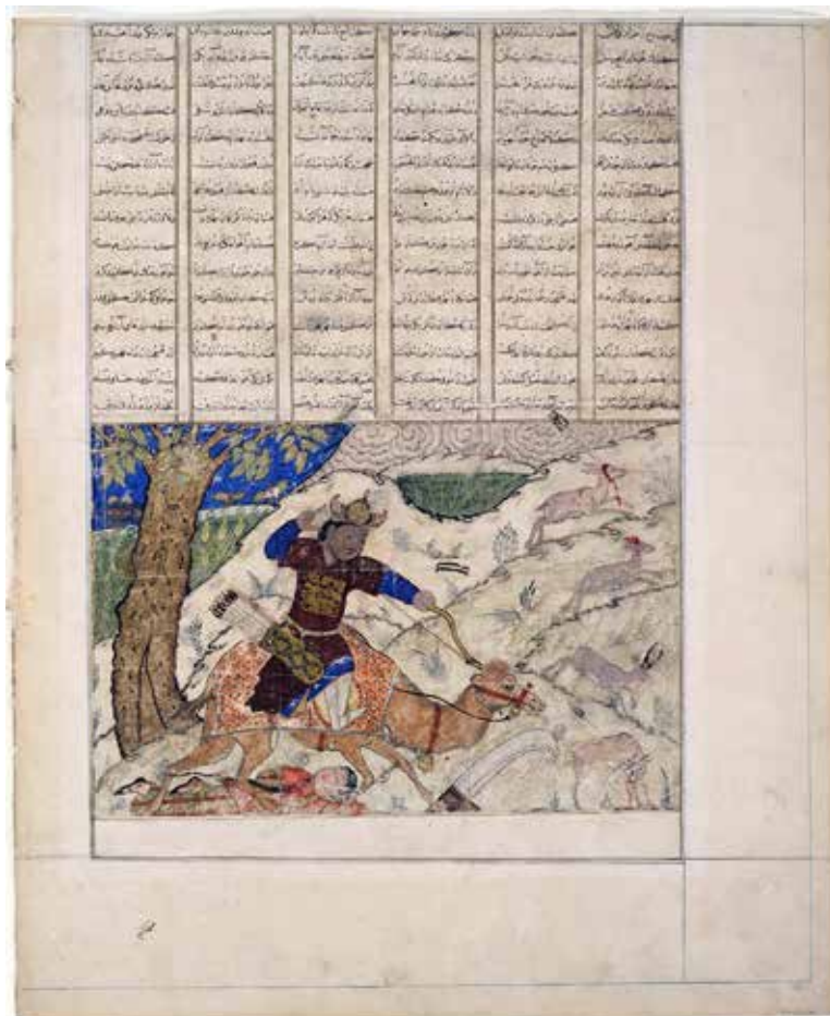
Fig. 9. Bahram Gur hunts with Azada, illustrated folio from the Great Ilkhanid Shahnama ( Book of Kings ), ca. 1330–1340, Tabriz. Collection of the Harvard University Art Museums < www.harvardartmuseums.org >.