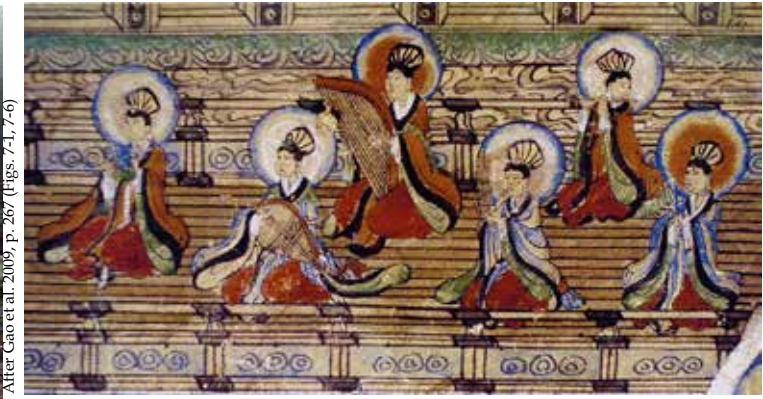
After Cao et al., 2009, p. 267 (figs. 7-1, 7-6)