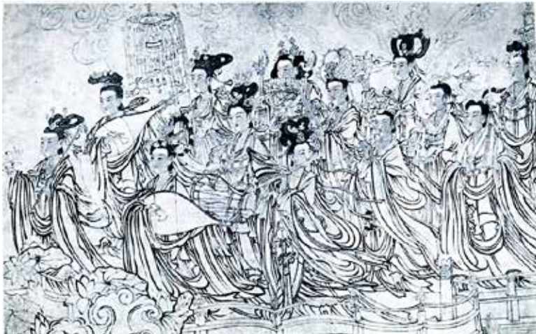
After Huo 1994, plate following p. 251

2011, p. 60). By the 10 th century, when the Karakhanids took Kucha away from the Uyghur idikut based in Kocho, Buddhist cave temples in that region, including Qumtura which had been patronised by the Uyghurs, were abandoned. Islamization of the Tarim Basin thus began in its western parts, including Kucha.