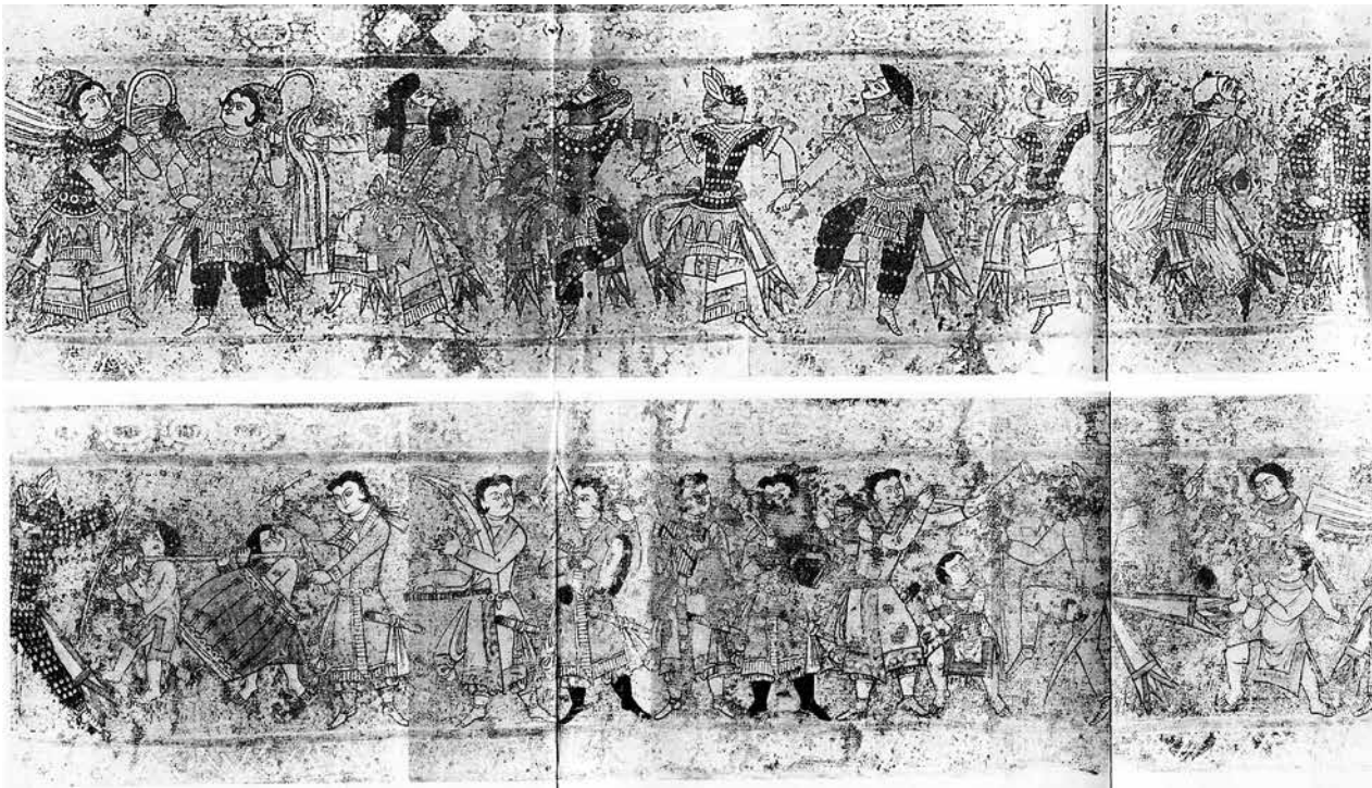
Fig. 4. Mask dancing with musicians, depicted on the 7 th -century reliquary casket excavated at Subax.