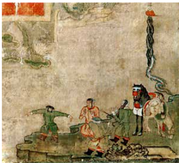
Fig. 6. Detail of silk banner depicting the “Water Moon Guanyin,” 12 th century, from Kara-Khoto. Collection of the Hermitage Museum X-2439.

After: Gao et al. 2009, pp. 35 (Fig. 1-27), 282 (VII-20)