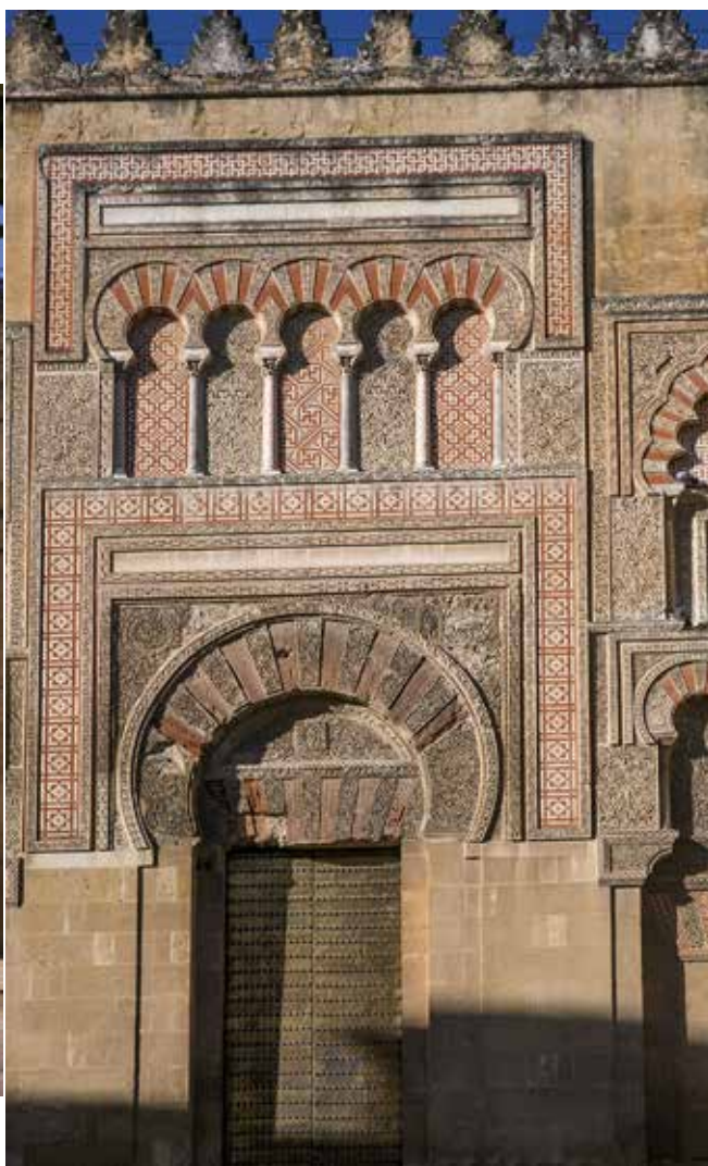
The Puerta de San José.