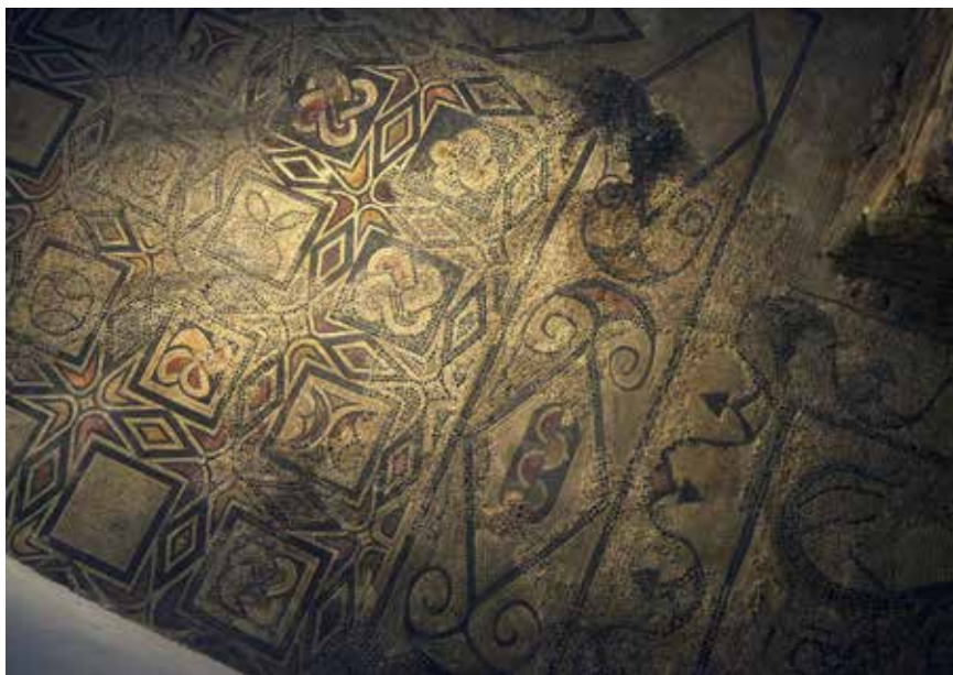
Mosaic (from the previous 6 th -century cathedral?) un- der the floor of the mosque