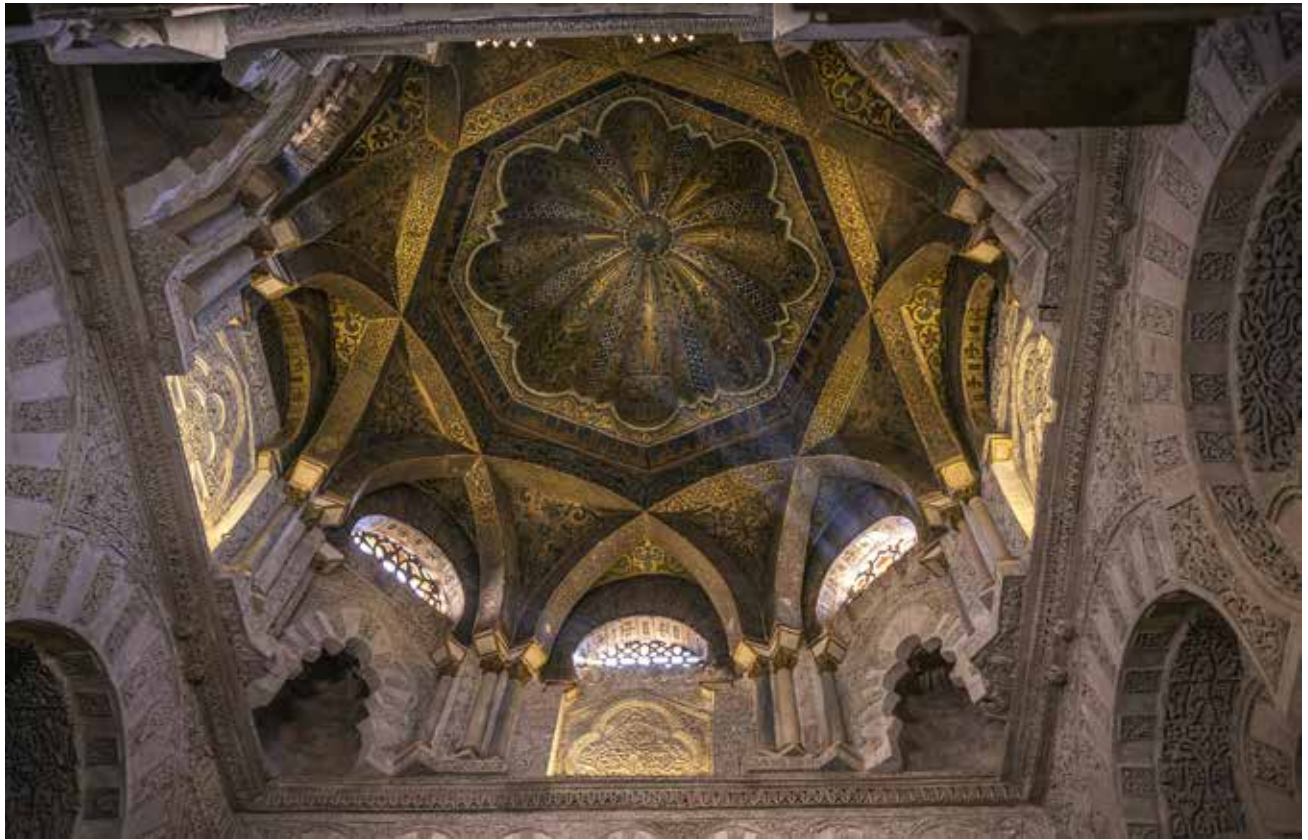
Plate VII – [Waugh, “The Mezquita,” pp. 163, 165]