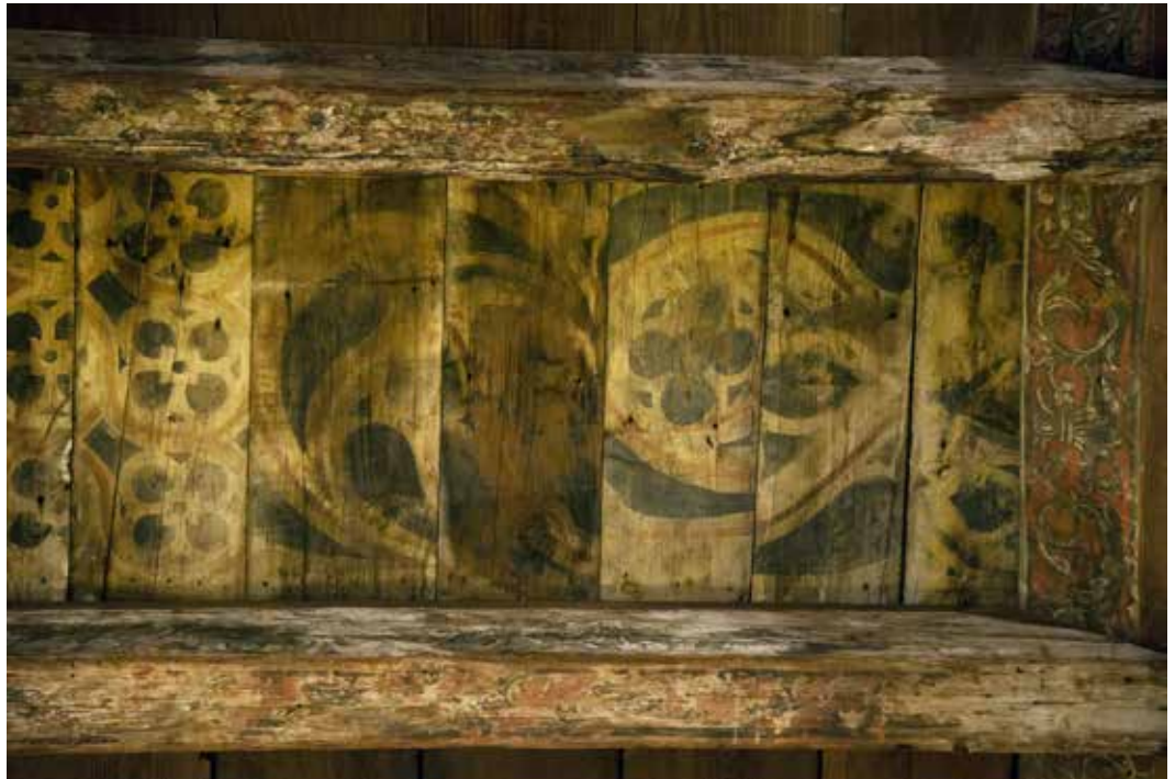
A surviving panel of the earlier painted ceiling.