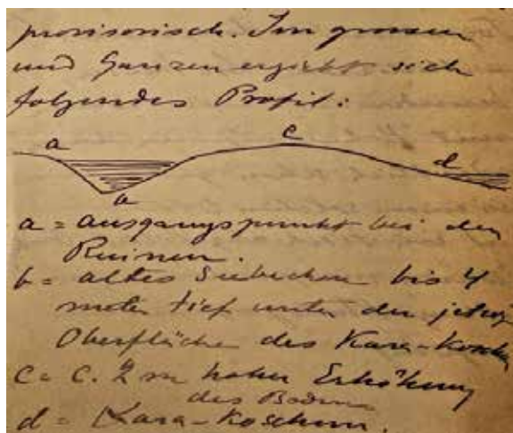
Fig. 3. Hedin's sketches of a profile and map illustrating his observations about Lake Lop Nor.

This letter is a rich account of Hedin's travels in the Lop-Nor region with details of his view on the Lop-Nor enigma. Aware that he is not only continuing Richthofen's theory but also starting to offer a new explanation of the puzzle about the lake's location, he describes his "excursions" in the area and provides two sketch-maps showing the relationship between the old lake, the new lake and the Kara-Koschun [Fig.