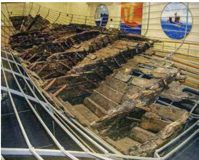
The mounted remains of the ship's timbers (p. 144).