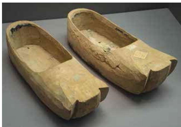
Wooden shoes, Turfan, 6 th -7 th century (Inv. No Bon 4122).