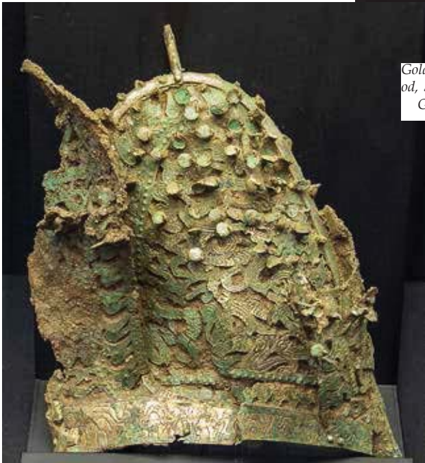
(top left) Gold crown, 5 th – 6 th century. Treasure № 338. Inv. № Bon 9663.