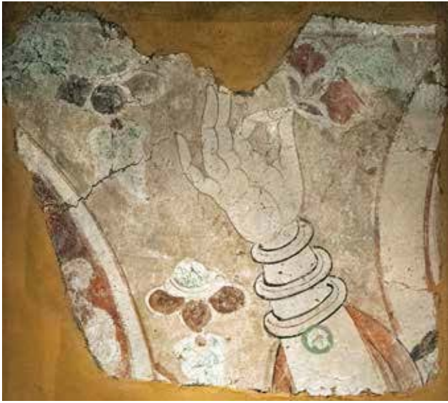
(top left) Mural fragment, hand of Buddhist devotee holding flower, from a Pravidhi scene, Bezeklik, Cave 15, 10 th -12 th century.