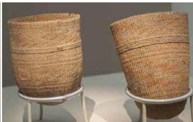
Masks and baskets from Loulan. Bronze Age, analogous examples known from the Little River (Xiaohe) cemetery, dated late 3 rd –2 nd century BCE.