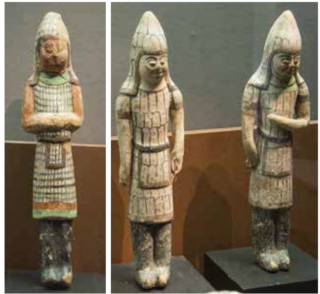
(top left and right) More tomb figurines (on right, Inv. № Bon 4142).