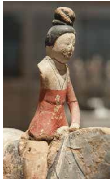
Artifacts from the Astana cemetery and Karakhoja, Turfan, 7 th –8 th century: (top left) Head of a guardian figure; (top right) guardian beast; (bottom left) figurine of a eunuch; (right) figurines of women. These mingqi are abundant, exhibited in various collections [e.g., a very large array in the Uighur Autonomous Region Museum (Urumqi); others in the Musée Guimet (Paris), the British Museum (London), and the National Museum, (New Delhi)].