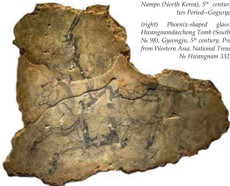
Mural fragment, from Ssangyeongchong Tomb in Nampo (North Korea), 5 th century (Three Dynasties Period--Goguryeo).

(right) Phoenix-shaped glass ewer, from Hwangnamdaechong Tomb (South Mound of Tomb № 98), Gyeongju, 5 th century. Probably an import from Western Asia. National Treasure № 193. Inv. № Hwangnam 3321.