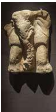
Terracotta appliques from Buddhist sites, the elephants, presumably representing the Indian deity Ganesha, from Qumtura, 8 th century; the others somewhat earlier from Khotan. Some of these probably were attached to mandorlas behind sculptures.