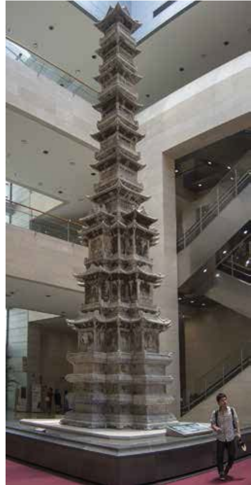
(right) Pagoda erected at Gyeongcheonsa Temple in 1348. National Treasure No 86. Inv. No Bon 6753.

The somewhat intimidating modern building with its open central corridor accommodates one of the first important indications that Korea indeed belongs on any map of the Silk Roads: the ten-storey pagoda erected in the 14 th century on whose lower tiers are scenes from the Chinese Journey to the West , an account based on the travels of Xuanzang in the 7 th century. Of course it would be possible never to make it beyond the first floor, where there is a chronologically arranged sequence of galleries, many of the objects classified as national treasures including rich finds from the 5 th -6 th century Silla Dynasty tombs in Gyeongju. Dazzled by the gold, one might easily