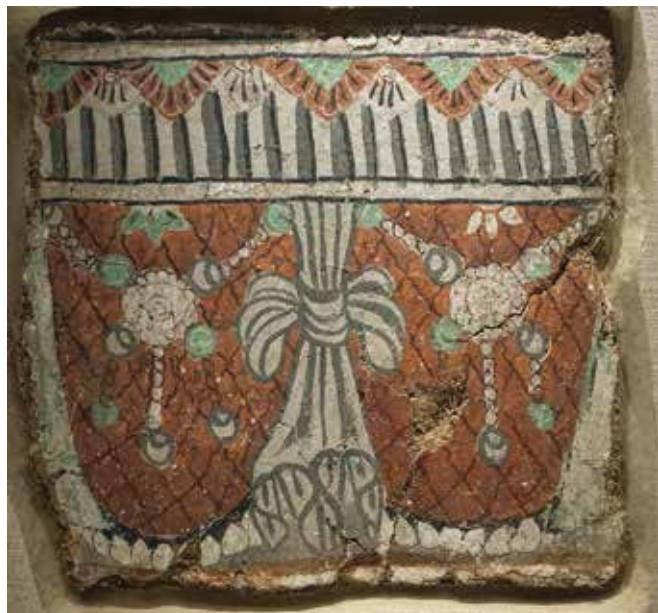
(bottom right) Decorative curtains, mural fragment, Bezeklik Cave 15, 10 th -12 th century.