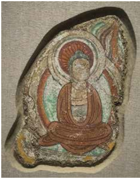
Mural fragments: (left) from Turfan (Bezeklik?), 10 th century (Inv. № Bon 4096) and (right) from Bezeklik Cave 18, 6 th –7 th century (Bon 4054).