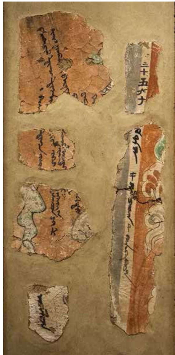
(right) Mural fragments with Uighur inscriptions, Bezeklik, 10 th century (Bon 4071-80).