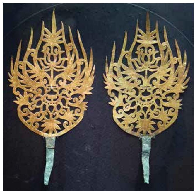
(bottom right) The queen's gold diadem ornaments. 3 Kingdoms period (Baekje), 6 th century. Gongju, Songsan-ri complex, Tomb of King Muryeong (r. 501-523), Chungcheong-do. National Treasure No. 155.

Note: The captioning is drawn from that in the museum itself.