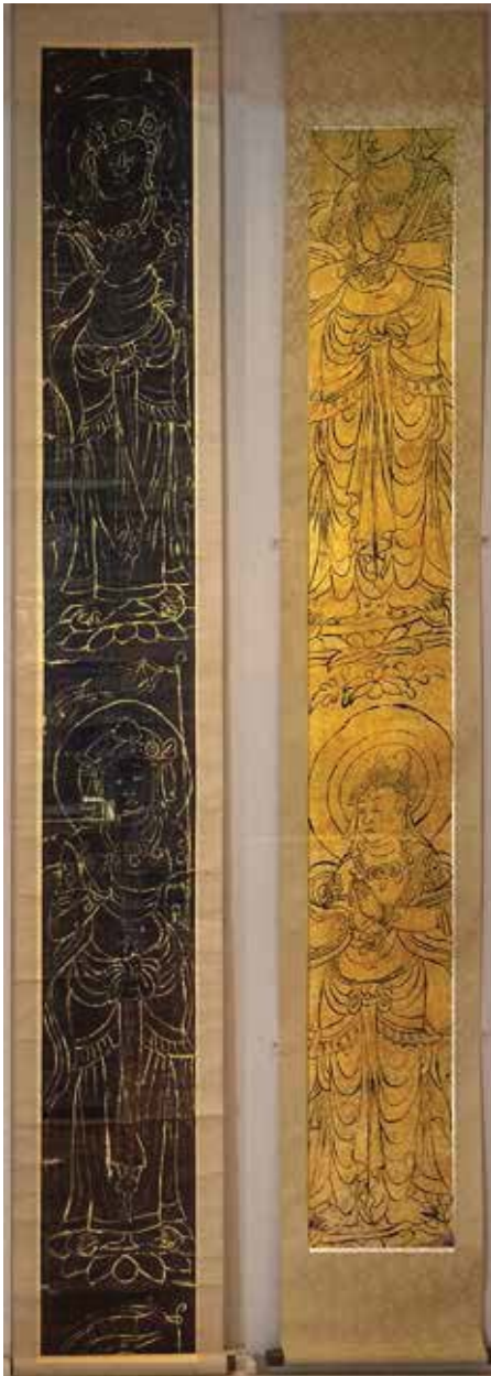
(left) Silk banners depicting Bodhisattoas, from Dunhuang, Tang Dynasty (Inv. No. Bon 4020, 4022).