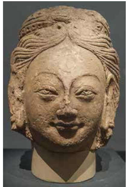
Heads of Buddhist deities, 6 th –7 th century, Turfan. Analogous examples were collected at Tumshuq by the Pelliot expedition at the beginning of the 20 th century; now in the Musée Guimet, Paris.