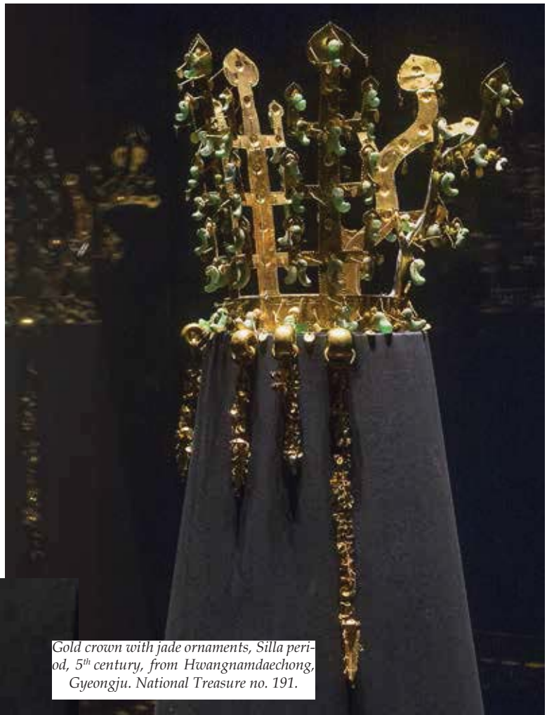
Gold crown with jade ornaments, Silla period, 5 th century, from Hwangnamdaechong, Gyeongju. National Treasure no. 191.