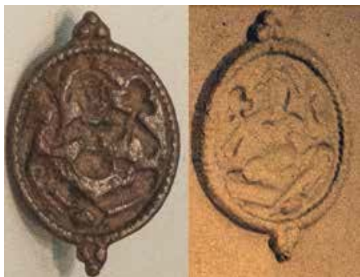
(right) Terracotta of Serapis and Harpocrates, Khotan, 2 nd –3 rd centuries CE, presumably transmitted from the Hellenistic or Roman East. Inv. No. Bon 3901.